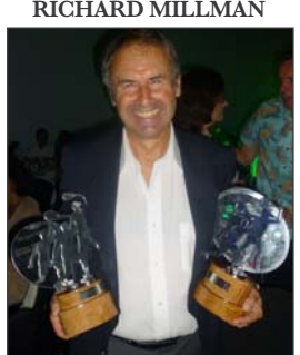
With the Nations Cup.