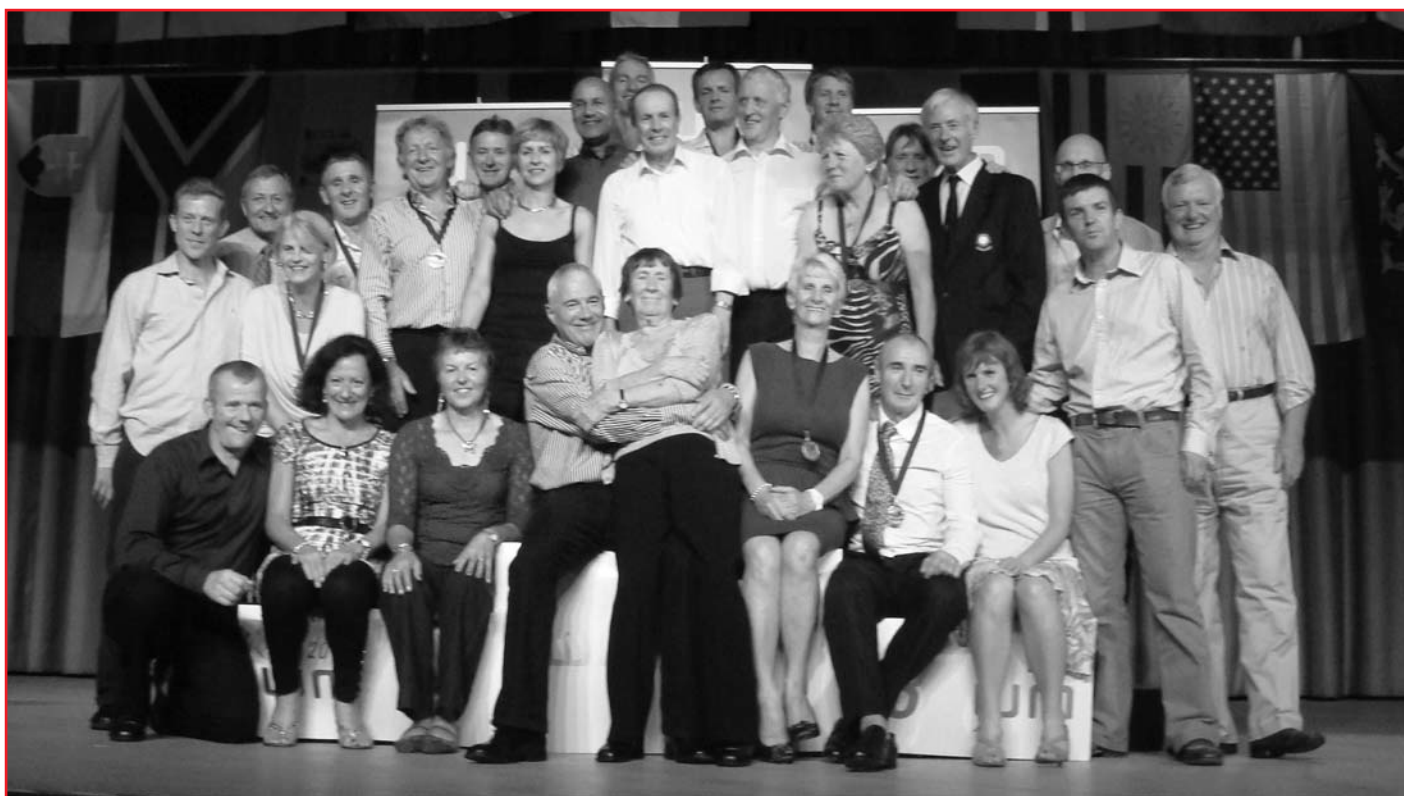
Some of the GB Vets members on the rostrum at the closing ceremony. More pictures on Page 4.