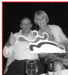
Newlywed Smiths in party mood.