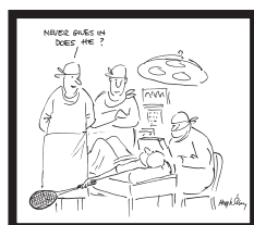
Never Gives In Does He?