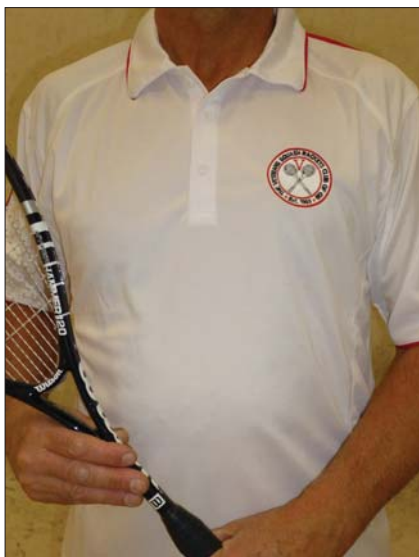
Men's Polo Shirts