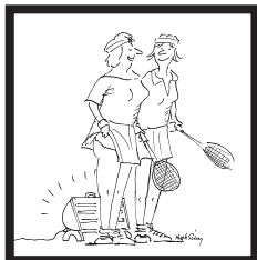
The Physical Warm-Up