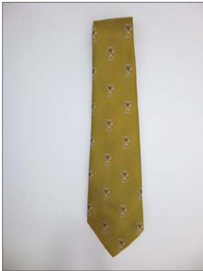
Anniversary Tie Gold