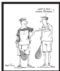
What is this ...Mixed Doubles?