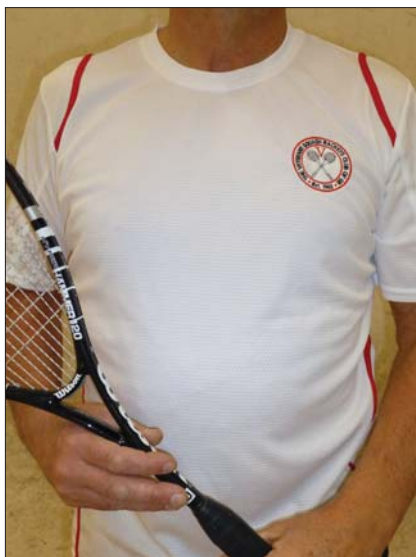
Men's Tee Shirts