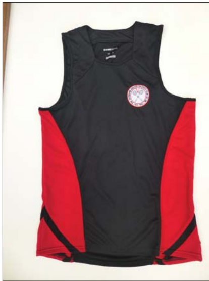
Women's Tee Shirt