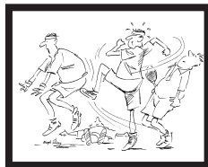
High Knee Kicks