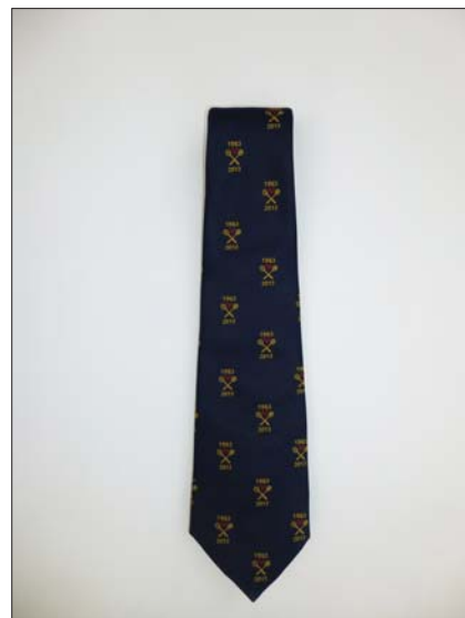
Anniversary Tie Blue