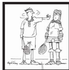
Protective goggles etc.