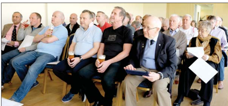
Members at the 54th AGM