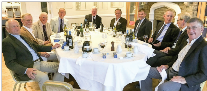
Enjoying the apres golf meal

Some 4 hours later assembled back in the bar with a glass in our hand, the stories of the day were recounted. The lost balls, bad bounces, missed putts and the usual golfing "If only".