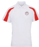
MEN'S POLO SHIRT