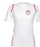
WOMEN'S & MEN'S T SHIRT