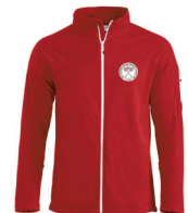
UNISEX WARM-UP JACKET