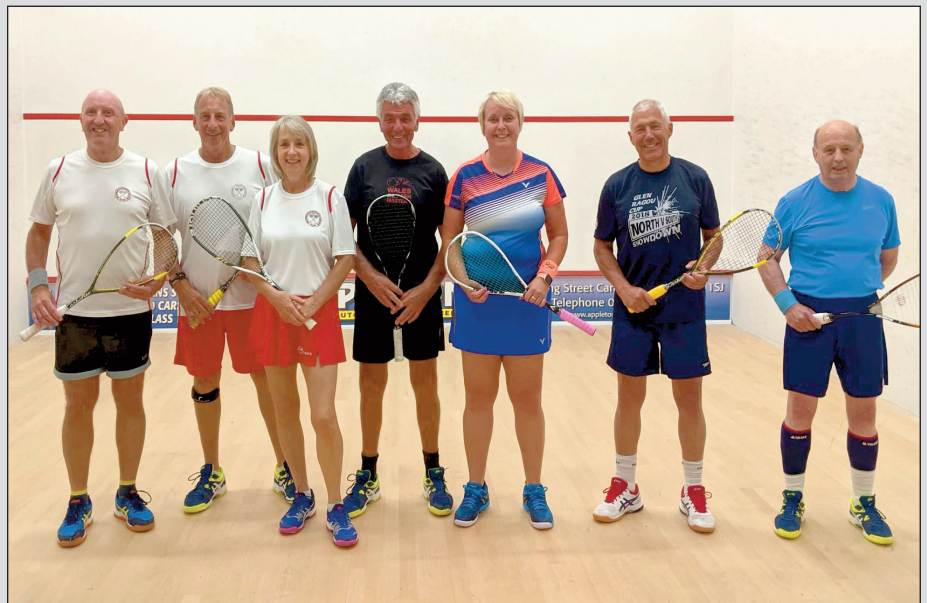
GB VETS TEAM